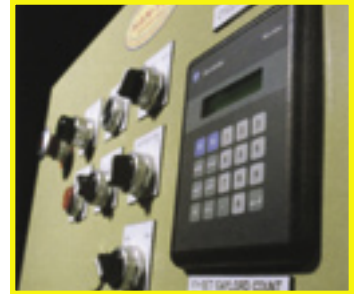
Controls are easy to operate, assuring proper gaylord filling every time.

Powder-coated surfaces, non-marking belts and stainless steel transitions eliminate the potential for scuffing and marring.